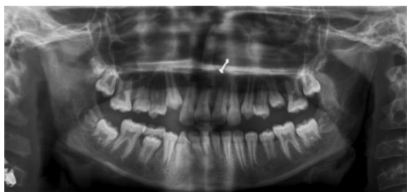
Fig. 2: Tooth eruption criteria; a line overlying the erupting tooth cusps have to reach the mesial and distal cemento-enamel junctions of the adjacent erupted teeth