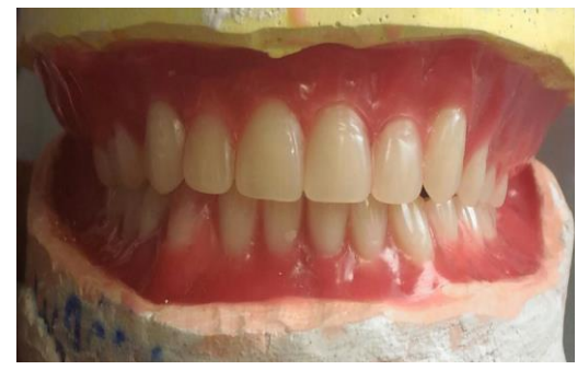
Fig. 5: Teeth arrangement