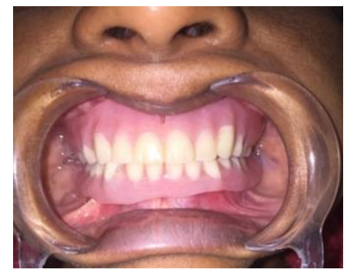
Fig. 6: Finished prosthesis in mouth