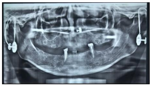
Fig. 1: Orthopantomogram after completion of root canal treatment

with endodontic plugger and peaso reamers. Indirect impression of both the prepared teeth was made with polyvinylsiloxane (DMG, Silagum) and subsequently poured to obtain a cast. Wax pattern was made over the prepared teeth. Metal copings were obtained by casting and cemented over the prepared teeth with Type 1 GIC (Fig. 3). Final impression, with coping in place on their respective abutment was made using a custom tray (Fig. 4). The jaw relation was recorded. Teeth arrangement was made and tryin was done (Fig. 5). Maxillary and mandibular complete dentures were fabricated following the conventional except that the recess was created on the impression surface of the mandibular denture to accommodate the abutments. The dentures were finished, polished and inserted into the patient mouth (Fig. 6). The patient was given instruction about insertion and removal as well as maintenance of the denture. Periodic follow-up was carried out.