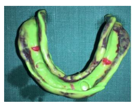
Fig. 4: Final impression