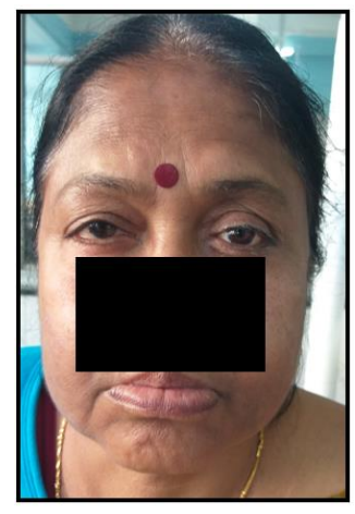
Fig. 6: Post operative view

Prosthesis was inserted into the socket, and checked for any areas requiring adjustment. The esthetics and comfort of the patient were evaluated. The patient was educated to insert and remove the prosthesis (Fig. 6).