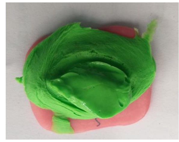
Fig. 3: Impression of the defect

The impression was carefully removed and beading and boxing were done (Fig. 3). Impression was poured in two sections in type IV gypsum product (Kalrock, Mumbai, India). The two-piece mold was retrieved from the impression. The mold was coated with a separating medium and melted modeling wax (DPI, India) is poured into the cavity. The mold was opened and the wax was removed. Sharp ridges and undesirable irregularities are eliminated carefully with the help of a wax carver and the surfaces of the wax pattern were made smooth. Wax was added until satisfactory contours of the eyelids were achieved both in open and closed positions.