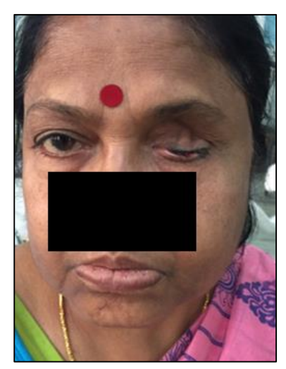
Fig. 1: Pre-operative view