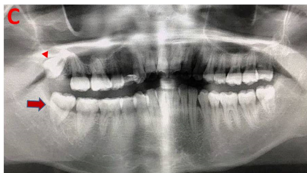
Fig. 3: Panoramic image in 7 months later, the lower right third molar of mandible was vertical. (right mandible third molar arrow, right maxillary third molar arrow)