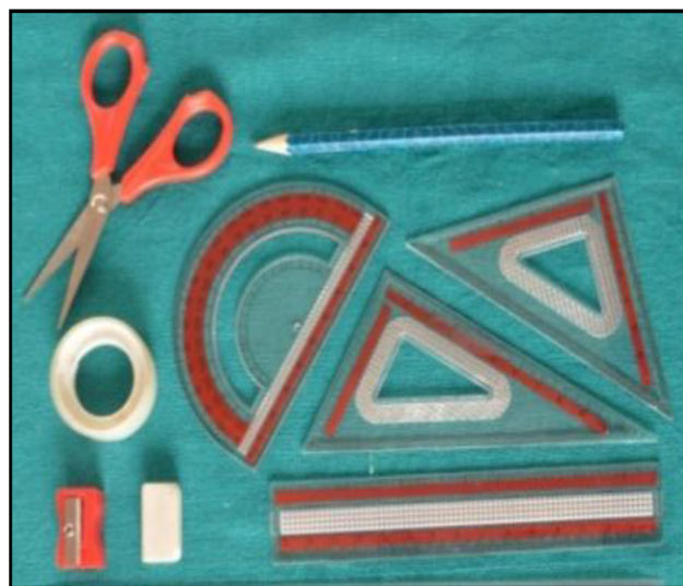
Fig. 1: Materials required for study

Ten orthopantomograms were picked at random to study the errors related to radiographic measures. After 4 weeks from the initial measurement, their tracings and observations were repeated. The inter- and intra-examiner error was determined using the Kappa test and Dahlberg's formula. The observed Kappa value was 0.86, showing strong agreement between the observers.