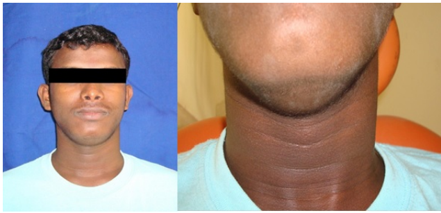
Figure 1: Extraoral photograph showing swelling in the submental region

was located in connection with the floor of the mouth. It extends anteriorly from the lingual surface of the alveolar process of teeth 31 and 41 to the base of the tongue posteriorly. From the lingual surface of the alveolar process of teeth 34 and 35 region, it crosses the midline to the region of teeth 44 and 45. The surface appears smooth and matches the colour of the surrounding mucosa. Upon palpation, the swelling is non-tender, soft, mobile, fluctuant, and compressible but not reducible. These findings confirm the initial observations related to the site, size, shape, and extent of the swelling.