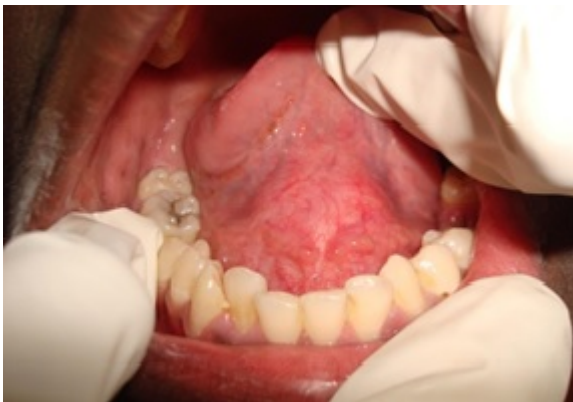
Figure 2: Intraoral photograph showing swelling on floor of mouth

was located in connection with the floor of the mouth. It extends anteriorly from the lingual surface of the alveolar process of teeth 31 and 41 to the base of the tongue posteriorly. From the lingual surface of the alveolar process of teeth 34 and 35 region, it crosses the midline to the region of teeth 44 and 45. The surface appears smooth and matches the colour of the surrounding mucosa. Upon palpation, the swelling is non-tender, soft, mobile, fluctuant, and compressible but not reducible. These findings confirm the initial observations related to the site, size, shape, and extent of the swelling.