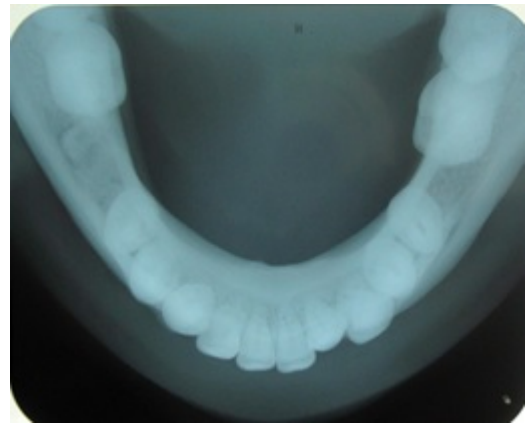
Figure 3: Mandibular occlusal radiograph

Radiographic examination with mandibular cross-sectional occlusal radiograph reveals missing 36 and loss of crown structure in 46 region suggestive of root stump 46. Ultrasonography, reveals a well-defined lesion, a solid echoic area with internal echoes seen within size 3.2×2.6×2.9 cm, seen posterior to the tongue. Features suggestive of an infected ranula. Following thorough examination and investigation, surgical excision was performed. Additionally, we also obtained consent from the patient to share his clinical and radiographic photographs for the purpose of academic interest and publication.