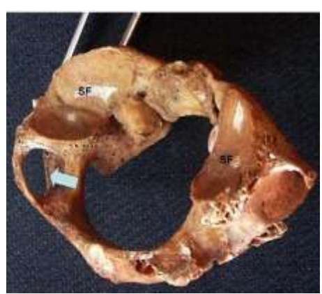
Fig. 1: Left supero-lateral view of the atlas vertebra showing the presence of complete arcuate foramen. On the right side: A – Anterior arch, P – Posterior arch, SF – Superior articulating facet, Block arrow – Right sided complete arcuate foramen