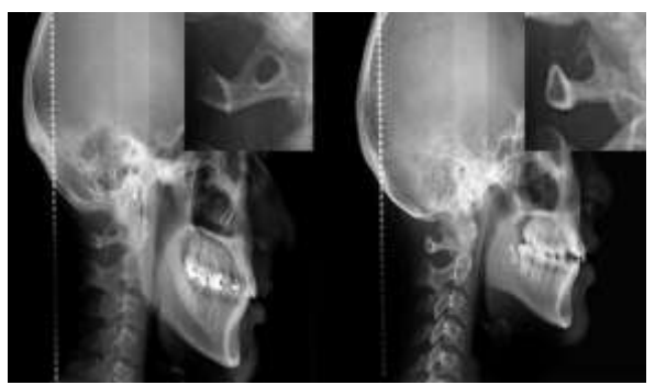
Fig. 5: In the left image observed a complete bony bridge while the right image shown a partial ossification