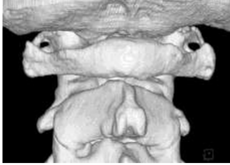
Fig. 3: Bilateral ponticuli lateralis seen on the threedimensional CT scan