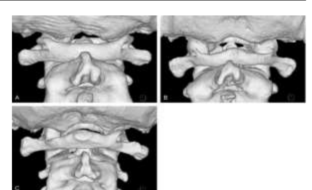
Fig. 4: Various types of ponticuli posticus seen on three-dimensional CT images. (A) Bilateral complete. (B) Complete on the left side and partial on the right side. (C) Unilateral