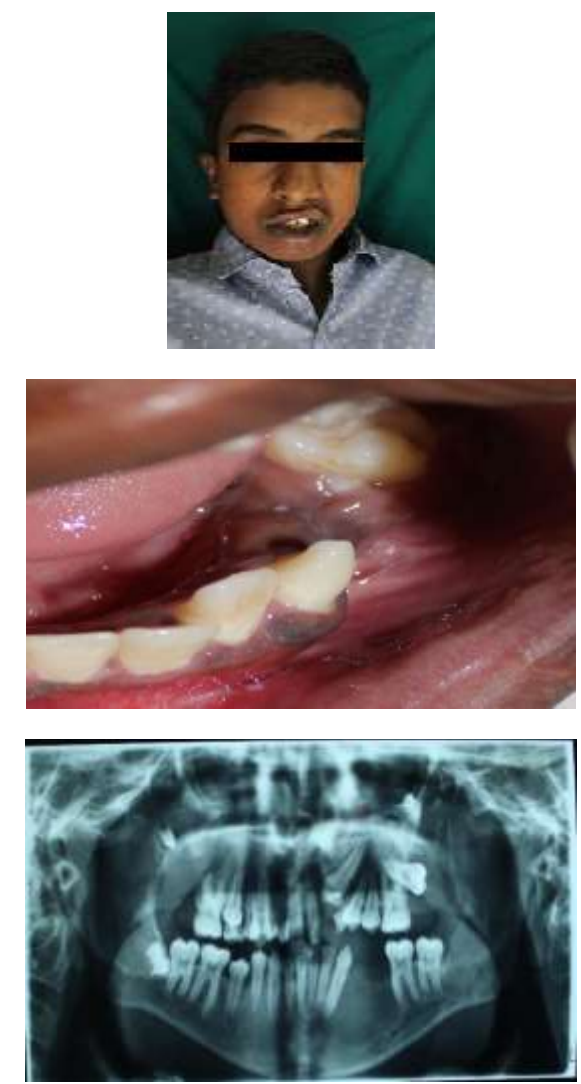
Fig. 4: Post-operative follow up shows healing of lesion

Patient was then revaluated after 3 months and 1 year, there was complete regression of swelling and OPG taken revealed adequate bone healing at the affected site.(Fig. 4)