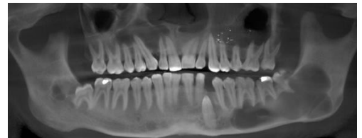
Fig. 5: Panoramic radiograph showing odontogenic keratocyst