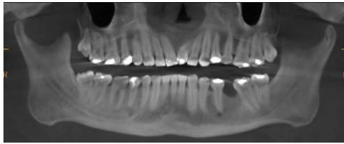
Fig. 1: Panoramic radiograph showing the periapical radiolucency in maxillary 1 st premolar region