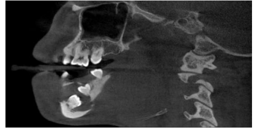
Fig. 4: Saggittal section of CBCT showing multilocular radiolucency with impacted 1 st and 2 nd mandibular molar in left side suggestive of Dentigerous cyst