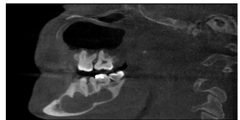
Fig. 6: Saggittal section of CBCT showing multilocular radiolucency