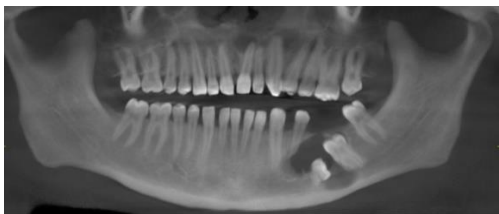
Fig. 3: Panoramic radiograph showing multilocular radiolucency in left mandibular 1 st molar region suggestive of Dentigerous cyst