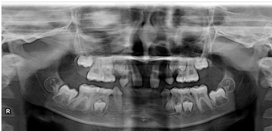
Fig. 2: Panoramic radiograph showing pattern of oligodontia: missing all four permanent mandibular incisors and maxillary lateral incisors; retained primary mandibular canine is seen