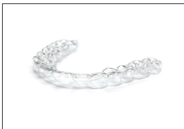
Fig. 2: Aligners built from CAD/CAM technology

Invisalign system digitally realigns the patient's teeth to create a series of 3D printed models to build aligners. The patient receives a new set of aligners every two weeks and repositions the teeth for a period of time. This technology saves time, the patient's record can be stored digitally, printed on demand and minimized physical memory requirements. With CAD / CAM technology, two separate bracketing and fork positioning processes merge into one unit. With this method, the need for maximum individuality with a reduced volume is put into practice. 8