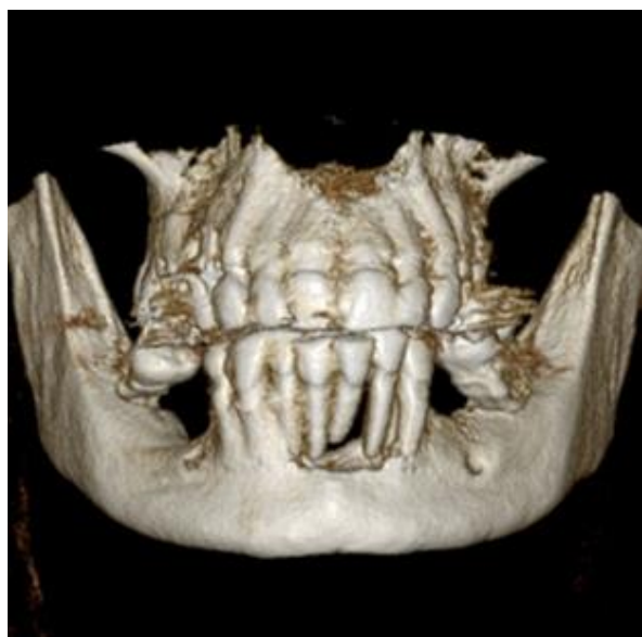
Fig. 5: CBCT of periodontitis

3D printed guides are all the more ordinarily utilized in periodontology for esthetic gingival reconstruction. Persistent explicit careful guides are used for gingivectomy and smile planning. 12 The utilization of 3D printing innovation in Regenerative periodontology is still under research. Studies are being done to assess the utilization of 3D printed biphasic platforms to help in tissue recovery of defects and in healing process. 13 This procedure is called as added substance biomanufacturing. A CT scan of the defect helps in creation of a wax mold from which is intended to make a scaffold that will help in guided tissue recovery. 14