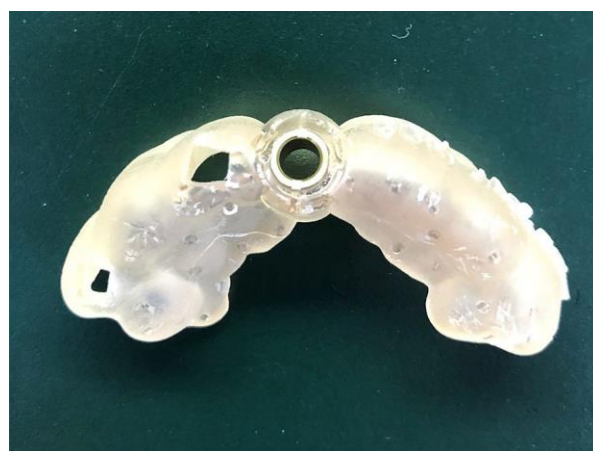
Fig. 6: Surgical splint

Endodontics also profits by 3D technology in the creation of exact aides for application in surgical as well as nonsurgical endodontic systems. 3D printed carefully help in a guided apicoectomy. Aides in nonsurgical endodontic methods are particularly useful for get to cavity planning in instances of calcified canals. 15,16 Utilization of 3D printing empowers production of tooth models with sensible anatomical root channel structures by utilizing CT image in this way giving dental students a chance to manage properly, rather than to use of typhodont teeth.