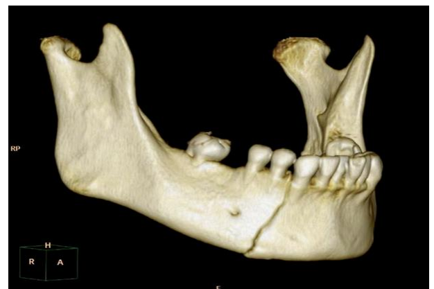
Fig. 1: 3d image of fracture of mandible

the complex structures before performing a surgery on patient. 5 When reconstructing jaw and facial defects, in addition to maintaining uniformity and anatomical appearance, it is also important to restore tissue function. Autologous bone grafts remain the standard for the reconstruction of jaw and facial defects due to their osteoconductive and osteoinductive properties. The main disadvantage of autologous bone grafting is that it is necessary to manually model the shape of the defect. Therefore, a less invasive treatment is needed to treat bone defects. Computer-assisted modeling and rapid production require a series of events that converts a computer-designed virtual three-dimensional image into a solid model for clinical use. 6 It is also used to customised reconstruction plates and morphological reconstruction of bony defect area for cases of fractures. 7