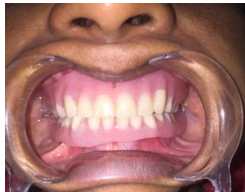
Fig. 6: Finished prosthesis in mouth