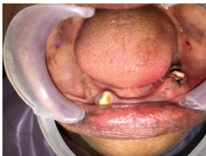
Fig. 2: Prepared abutment tooth