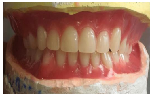
Fig. 5: Teeth arrangement