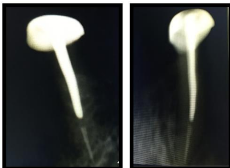
Fig. 3: IOPA view of cemented copings