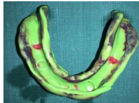
Fig. 4: Final impression