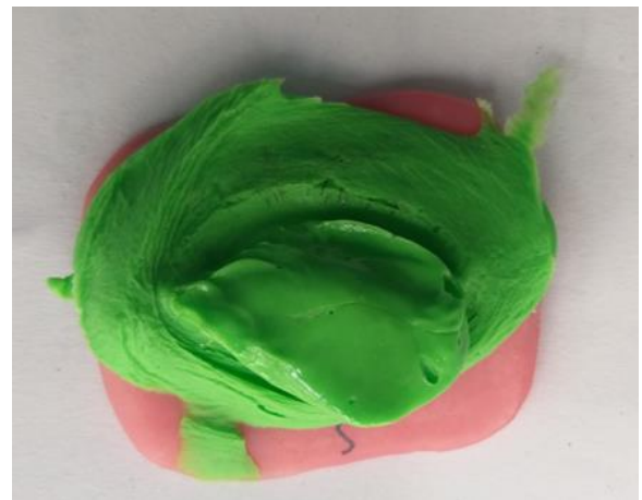
Fig. 3: Impression of the defect

The impression was carefully removed and beading and boxing were done (Fig. 3). Impression was poured in two sections in type IV gypsum product (Kalrock, Mumbai, India). The two-piece mold was retrieved from the impression. The mold was coated with a separating medium and melted modeling wax (DPI, India) is poured into the cavity. The mold was opened and the wax was removed. Sharp ridges and undesirable irregularities are eliminated carefully with the help of a wax carver and the surfaces of the wax pattern were made smooth. Wax was added until satisfactory contours of the eyelids were achieved both in open and closed positions.