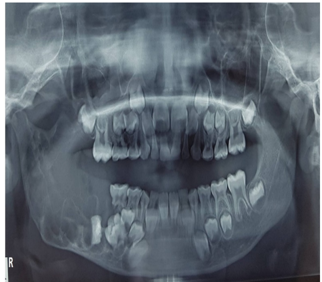
Fig. 2: OPG showing well-defined, multilocular radiolucent lesion on right posterior mandible