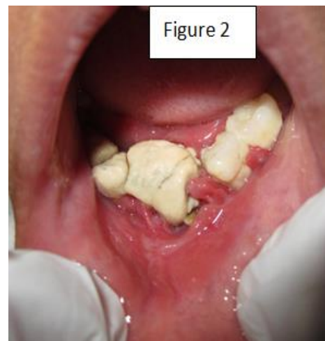
Fig. 2: Intraoral Picture