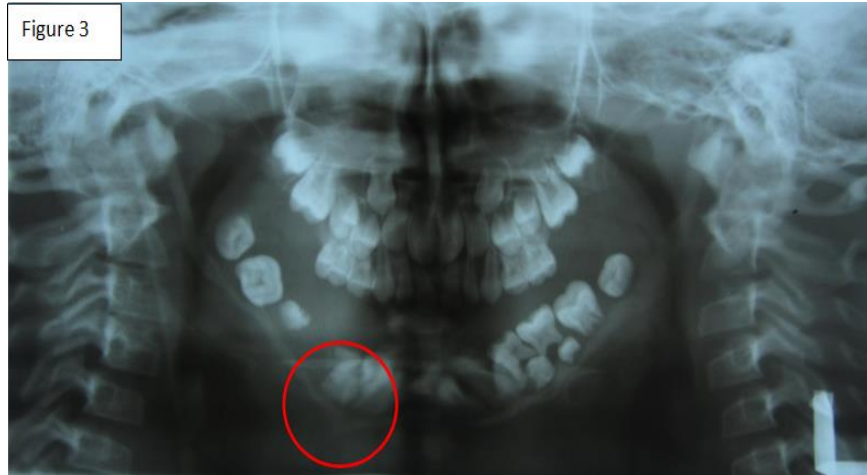
Fig. 3: Panoramic Radiograph