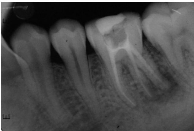
Fig. 2: Post-operative radiograph

Radiographic examination revealed, a radiolucency involving pulp with obliteration of periodontal ligament space periapically with respect to mesial and distal roots. The medical history of the patient was non-contributory.