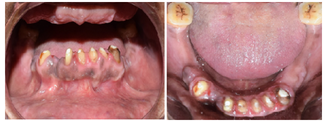
Fig. 4: Intraoral view after teeth preparation