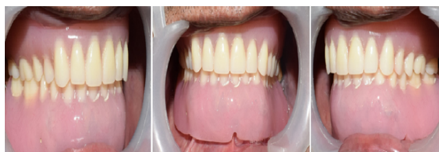
Fig. 8: Final prosthesis.

The metal copings were fabricated on the obtained casts and finished and tried in the patient's mouth and were luted on the abutment teeth (Figure 5).