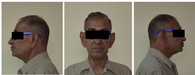
Fig. 1: Preoperative view

Diagnostic primary impressions were made with reversible hydrocolloid (Zelgan, Dentsply) impression material using edentulous stock trays (Figure 3). To obtain a favourable crown root ratio and avoid encroachment of the teeth into the interocclusal space, endodontic treatment was carried out for remaining teeth and tooth preparation was completed. The abutment teeth were reduced in vertical height to 2mm above crest of the ridge. A dome-shaped preparation with a chamfer finish line was done for all the teeth. The preparation rounded to minimize the horizontal torque on the roots (Figure 4).