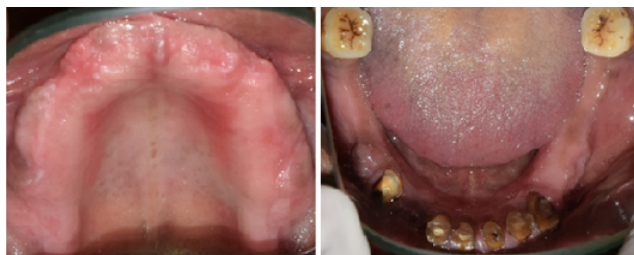
Fig. 2: Intraoral examination