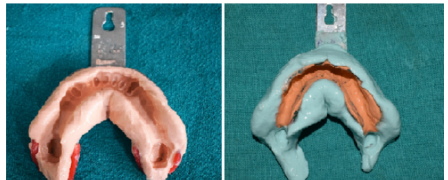
Fig. 6: Primary and final impression for mandibular arch.