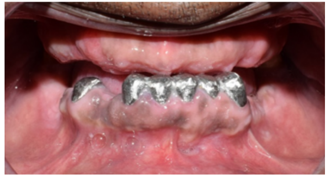
Fig. 5: Metal coping luted on prepared teeth