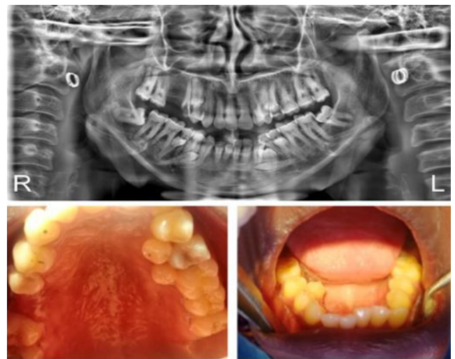
Fig. 1: Clinical and OPG

A 25-year-old African female reported to the outpatient department with chief complaint of pain in right upper back tooth region for last two days. Familial history and medical history were non contributory. On clinical examination, Extra orally no abnormality was revealed. Intra orally deep dentinal caries was noted in 15 (FDI Notation). Thorough examination of oral cavity revealed 3 supernumerary premolars, two in upper and one in lower arch each. (Figure 1). OPG showed One Supernumerary teeth in relation to 15, Two in relation to 13,15 Three in relation to 34,35, Two in relation to 44,45. A total of 8 supernumerary teeth were noticed of which 3 were clinically apparent and 5 were impacted. According to the notation given by Sarjeev (2013), 16 these teeth can be notated as \alpha 4S, \beta 4S, \beta 5S, \gamma 4S, \gamma 5S, \gamma 3S, \delta 3S, \delta 5S (Figure 2) The patient was referred to a general physician to rule out the presence of any syndromic etiology. The patient had no complaint with the erupted supernumerary teeth. She was educated with the radiographic findings and adequately counselled regarding the unerupted supernumerary teeth and their associated complications. A regular follow up was undertaken to monitor the.