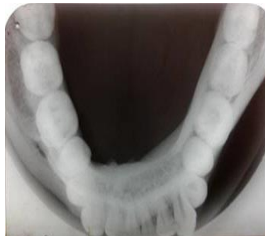
Fig. 4: Occlusal radiograph showing enlargement of right side of body of mandible