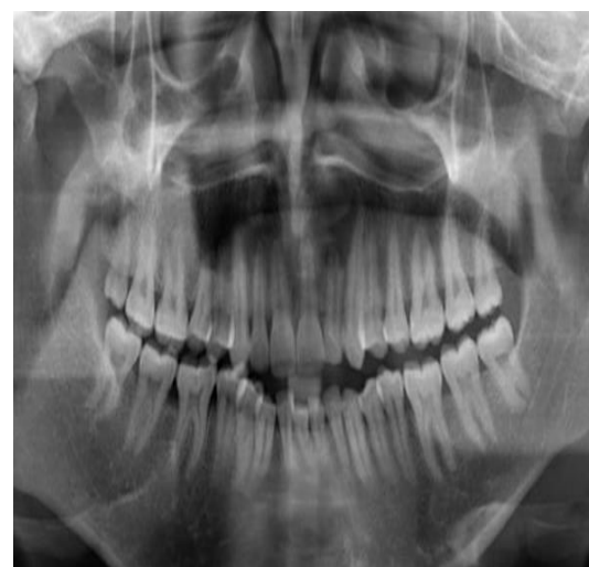
Fig. 5: OPG enlargement of the right condyle and elongation of the right ascending ramus as well as increase in width of ramus of mandible