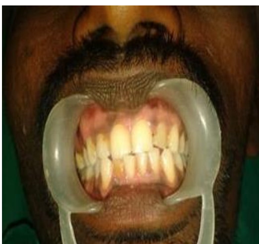
Fig. 3: Anterior Cross bite with midline shift