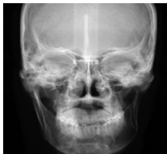
Fig. 6: PA skull radiograph showing deviation of mandible towards left side with facial asymmetry