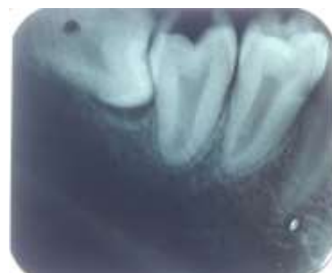
Fig. 1: Intraoral Periapical Radiograph revealing single root and single canal of Mandibular right 1 st 2 nd and 3 rd molar

single root canal along with normal crown length and cervical constriction of canal at the level of CEJ in all the three teeth i.e. mandibular right 1 st , 2 nd and 3 rd molars. (Fig. 1)