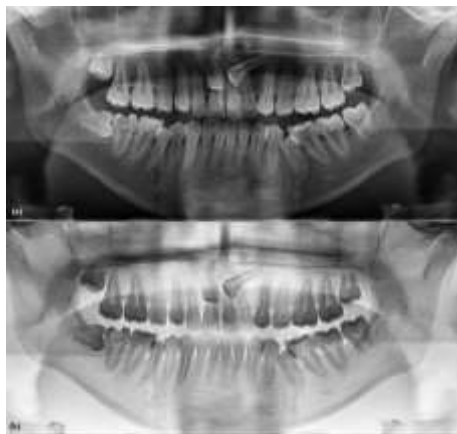
Fig. 2: Digital OPG (2a) and its inverted Image (2b) illustrate single rooted premolars and molars with single canals in all the four quadrants

Following these Findings of IOPA and OPG, A CBCT scan was recorded to evaluate root anatomy and canal morphology. Reconstruction of axial, coronal, sagittal and panoramic slices at thickness of 180 microns at 85kv, 4mA with 8.01sec exposure and 10 X 10cm field of view confirmed single root and single canal in all the premolars and molars in two dimensional planes (Fig. 3a, 3b and 3c).