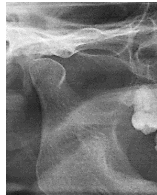
Fig. 2: OPG showing unilocular ZACDs on right side

within, resembling mastoid air cells. The trabecular type is basically a multilocular entity with internal bony striations. (1,2,4)