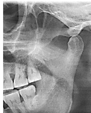
Fig. 3: OPG showing multilocular ZACDs on right side

Imaging Modalities: Panoramic imaging is the most useful method for diagnosing PAT. Trans-orbital view can also be an adjunctive projections for visualization of PAT. However, radiographic projections like submentovertex, transcranial, Towne's, or Water's views do not provide good visualization of the articular eminence. (5)