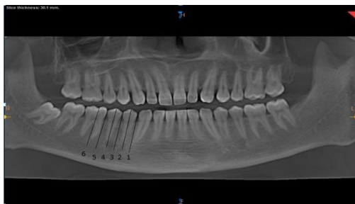
Chkoura, EL Wady13, P. 72