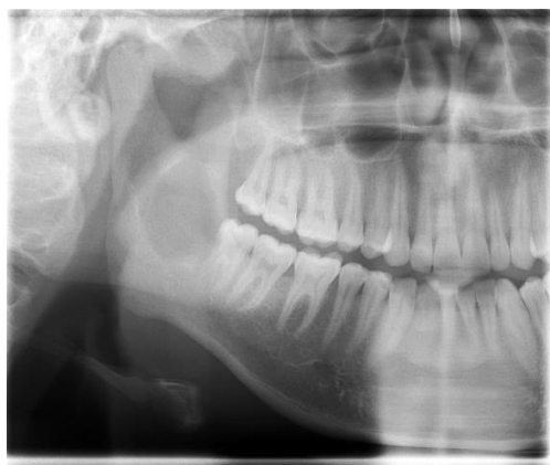
Fig. 5: Digital panoramic x-ray