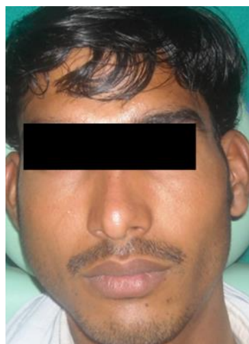
Fig. 7: Post operative front view