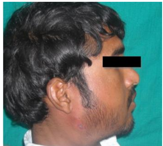
Fig. 2: Side view