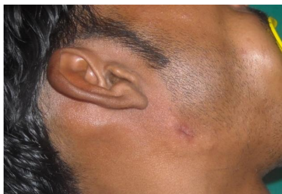
Fig. 8: Post operative side view