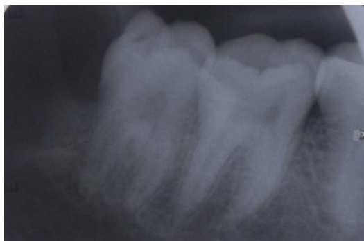
Fig. 3: Digital Iopar