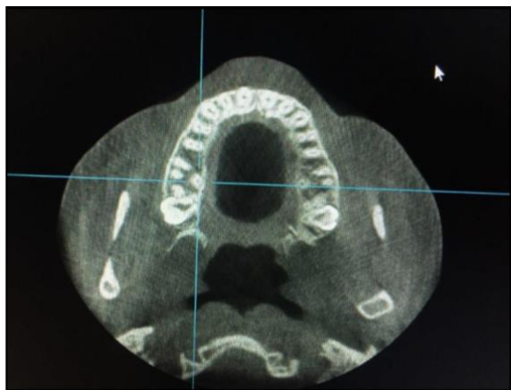
Fig. 2: Selection of the tooth (maxillary posterior tooth) in cross sectional view