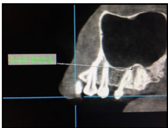
Fig. 3: Calculation of the vertical relationship between maxillary sinus floor and root of maxillary posterior tooth in sagittal view