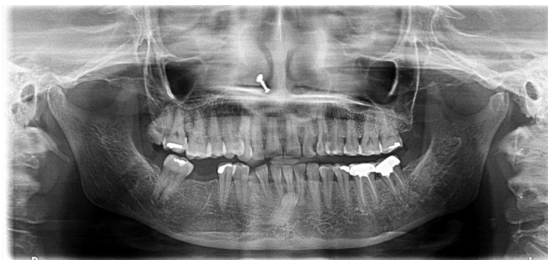
Fig. 2: Orthopantomograph