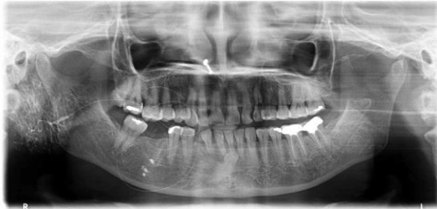
Fig. 3: Sialograph