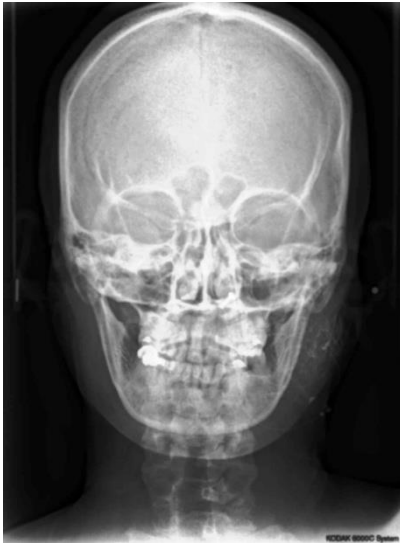
Fig. 4: PA-skull